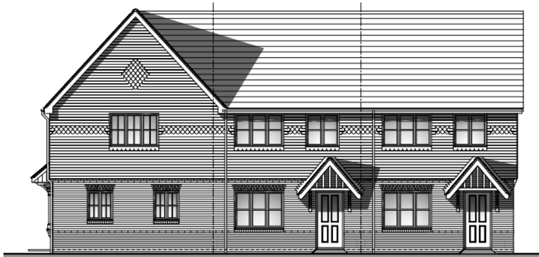
Epsom Front / Side Elevation